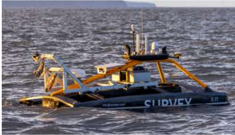
Figure 3: USV with towed sensors

Safety Precautions: The USV is equipped with the following to make it conspicuous to other marine traffic: