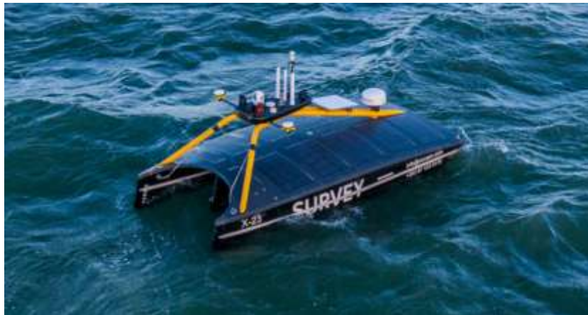
Figure 2: USV with hull mounted sensors

Situational Awareness: Although the USVs are uncrewed, they are remotely piloted throughout the 24-hour operation. The USV sends real time images and situational awareness data over satellite to allow this monitoring. The situational awareness aids available are listed below.